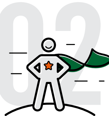
Empowered advocates and change makers.