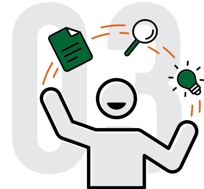
Adaptable and resilient in complex and changing times.